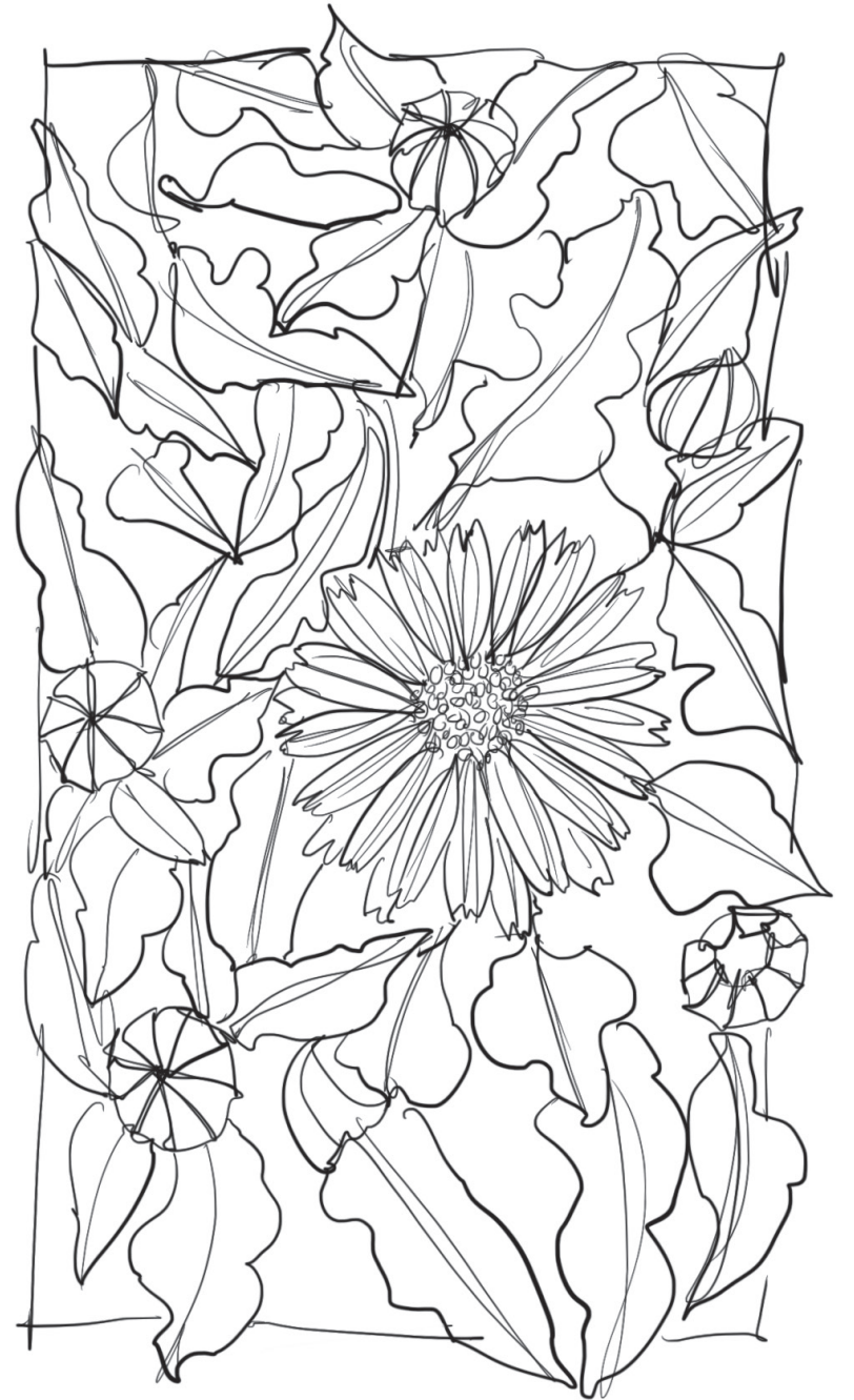
Marigold flower and buds