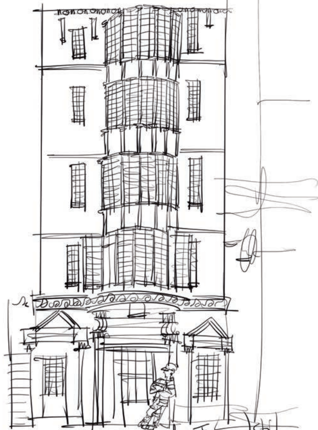
Snow Hill—strangely Jugendstil old police station on the site of the Swallow's Head Inn