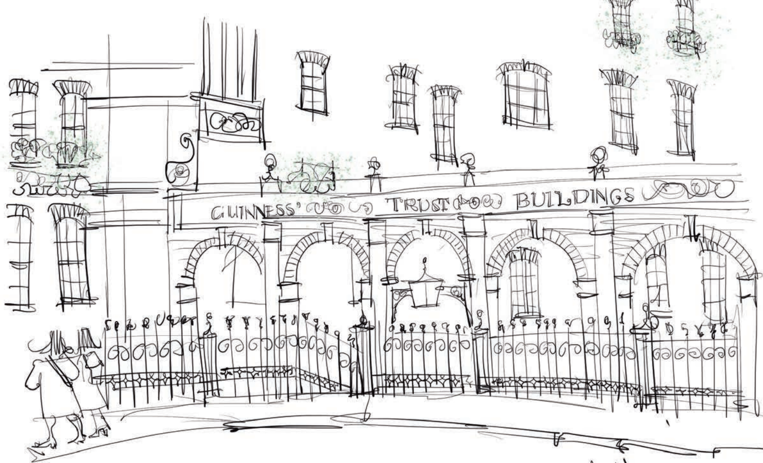
Snowfields — Guinness Trust Buildings