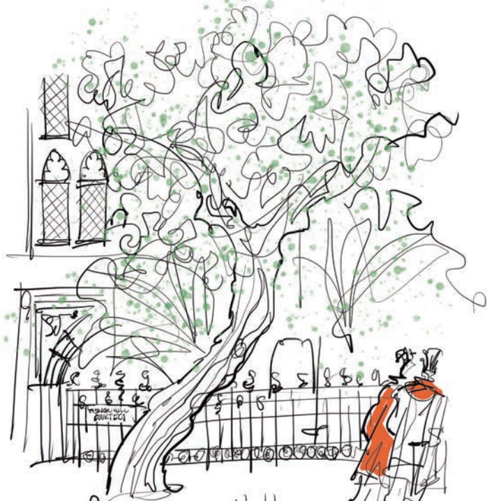
View from Snow Hill Holy Sepulchre the musicians' church