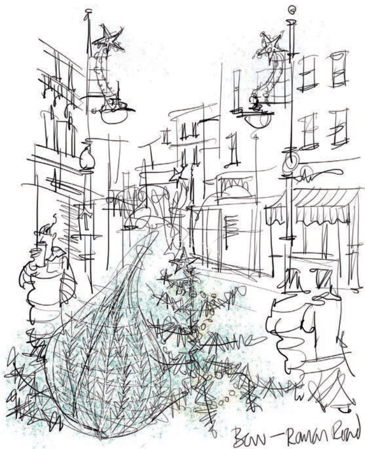
Bow - Roman Road