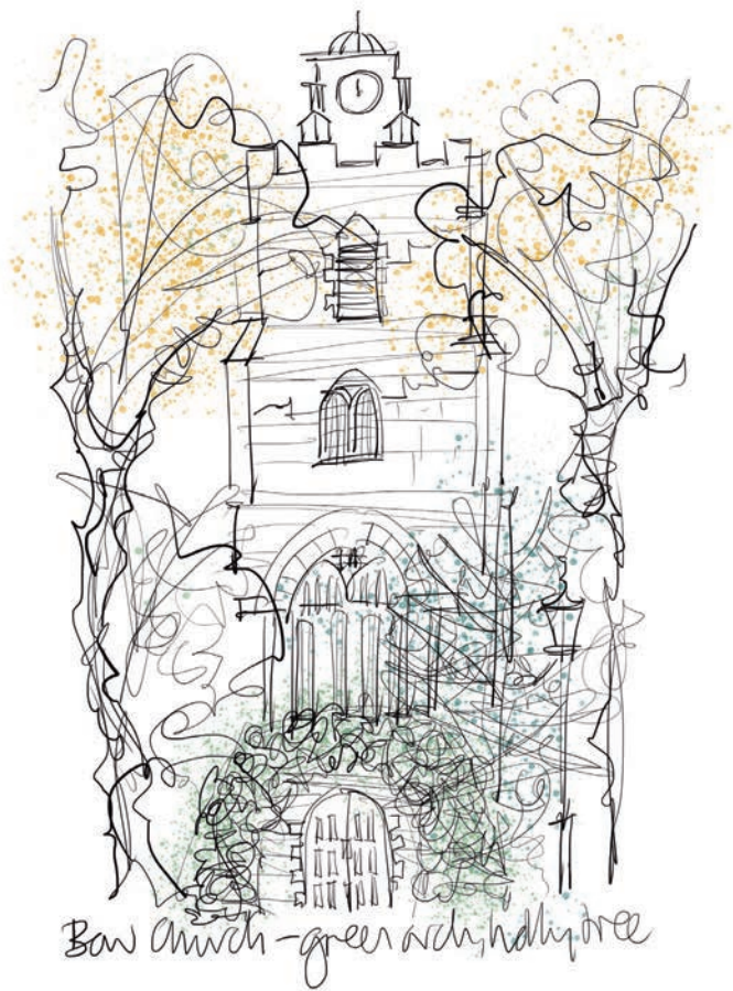
Bow Church - green arch, holly tree