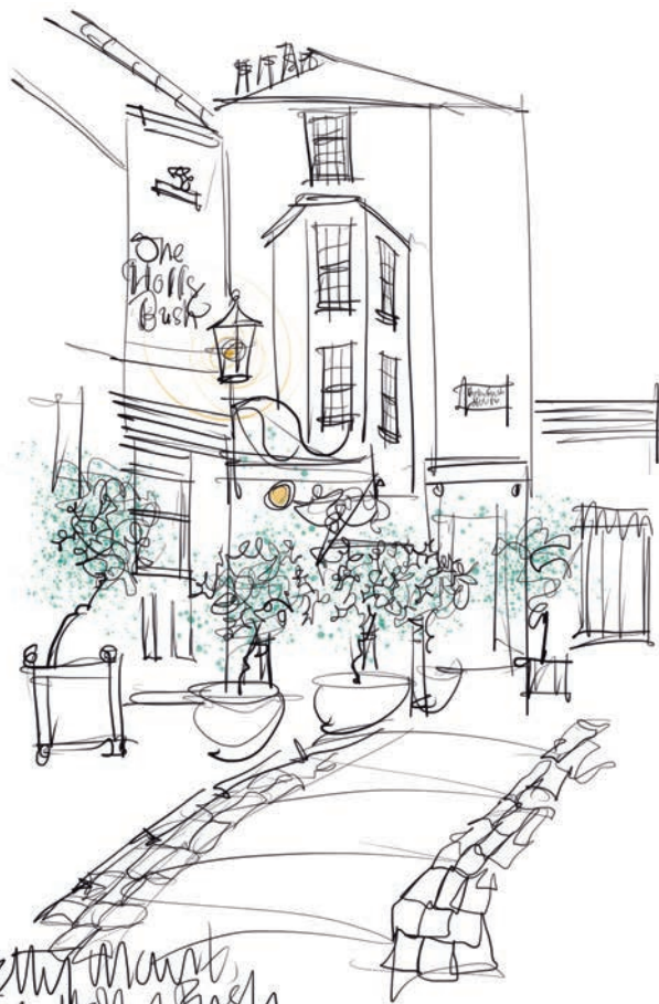
Holly Bush, the Holly Bush