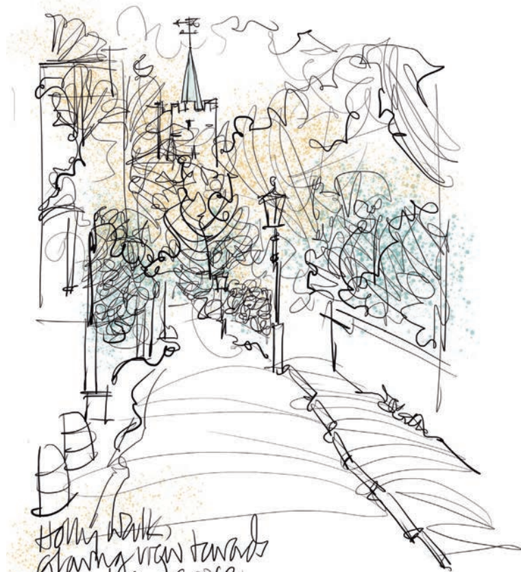
Holly Walk, glaring view towards Sunset and Spire